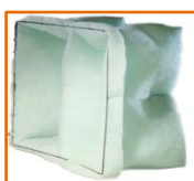
V Cube Filters