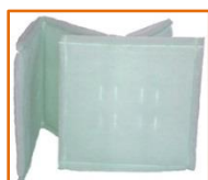
Links & Panels

Viskon-Aire* Corporation manufactures a complete line of complementary pre-filter products. Viskon-Aire* offers self-seal panel filters and links, Series 440 V Cube type pockets that incorporate our proprietary FDA PBT-32 non-drying tackification system that is roller coated deep into the media at high pressure. The Series 440 V cube filters can be purchased in either 2 or 3 pocket configurations using either the self-sealing spring-loaded metal ring that seals the overlapping media snugly into a filter frame, or metal headers for side-access systems. Viskon-Aire* Corp. also manufactures a complete line of synthetic and air-laid microfiberglass pocket filters including the newly introduced "Revolution" sustainable synthetic pocket filter series. With Viskon-Aire's high quality pre-filter portfolio, you can select filters which will protect your final filter investment and ensure long life of the total filter system.